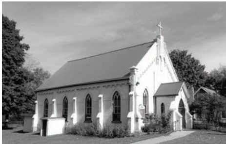
SACRED HEART - WARMINSTER