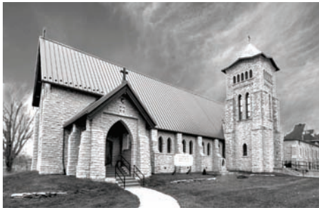
ST. ANDREW'S - BRECHIN