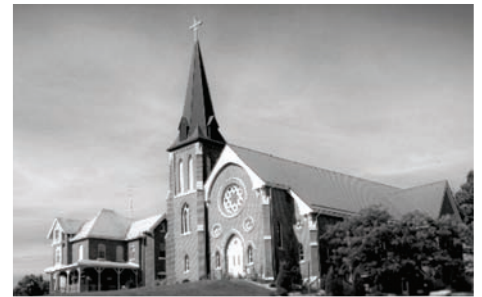
ST. COLUMBKILLE - UPTERGROVE