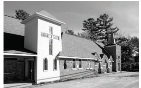
ST. FRANCIS - WASHAGO