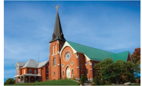
ST. COLUMBKILLE - UPTERGROVE