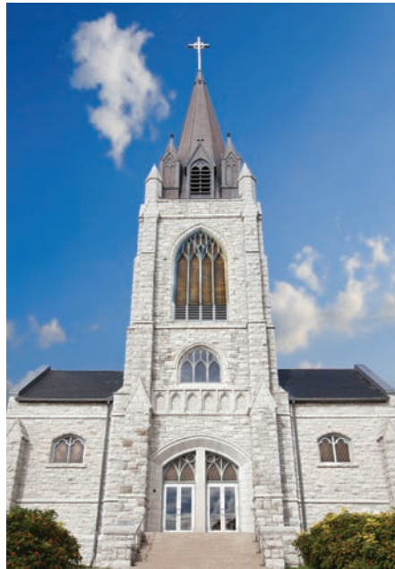
GUARDIAN ANGELS - ORILLIA