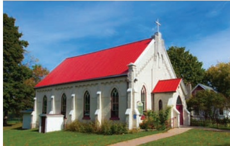
SACRED HEART - WARMINSTER