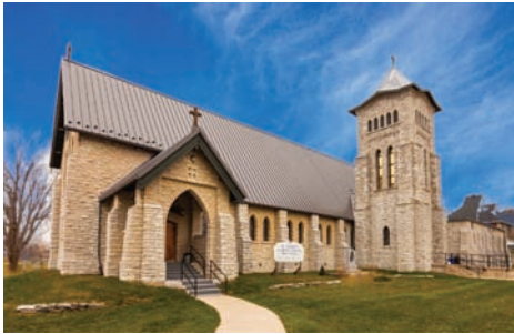
ST. ANDREW'S - BRECHIN