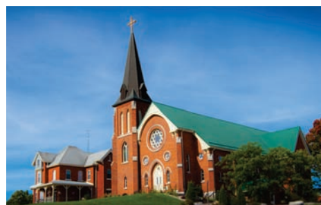
ST. COLUMBKILLE - UPTERGROVE