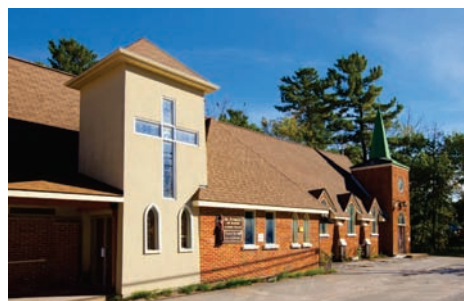
ST. FRANCIS - WASHAGO