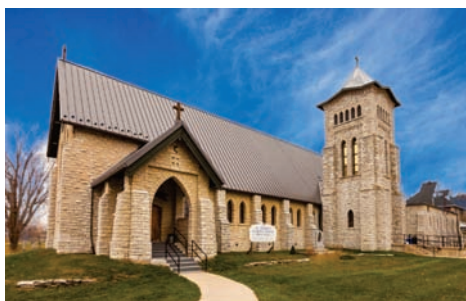
ST. ANDREW'S - BRECHIN