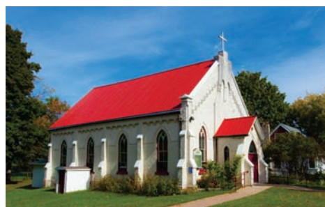
SACRED HEART - WARMINSTER