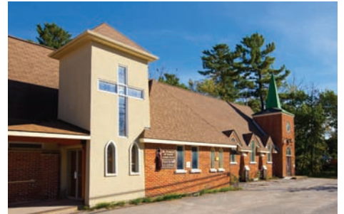
ST. FRANCIS - WASHAGO